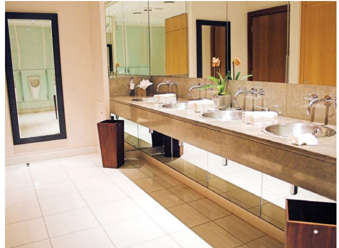
Figure 1 – Examples of VOCs and Sources

The iAQ Module operates by signaling fans to turn on when VOCs are present, and off when air quality returns to normal. The module includes features such as low power consumption and auto-calibrating sensing technology. The iAQ Module can also reduce utility costs and optimize proper ventilation, thus ensuring the highest air quality in commercial restrooms.